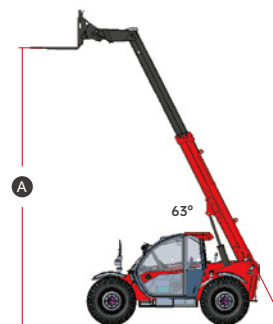
Rough terrain load chart Standard EN1459 B